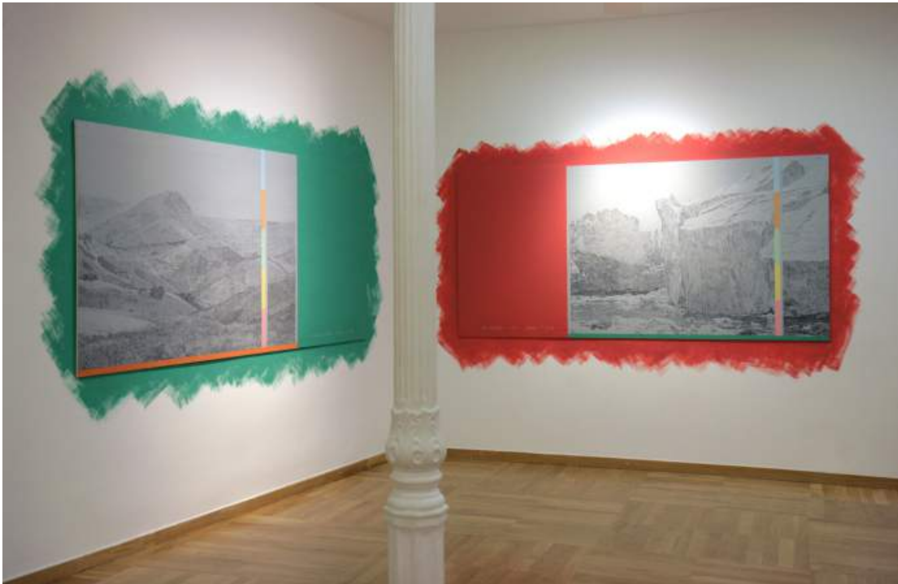
NF/ MEDITACIONES ATMOSFÉRICAS. ANTES DEL PRESENTE (603-7465 U) 2017 Installation view Slowtrack, Madrid