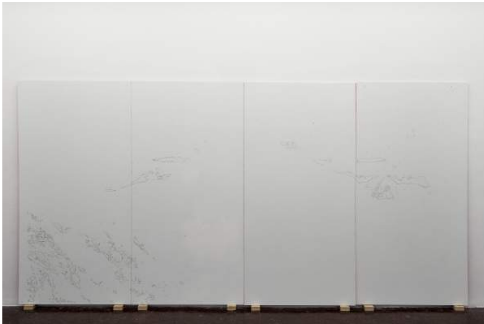
NF / Laura F. Gibellini Drawing a Mountain 2020-21 Oil stick on foam board 200 x 420 cm