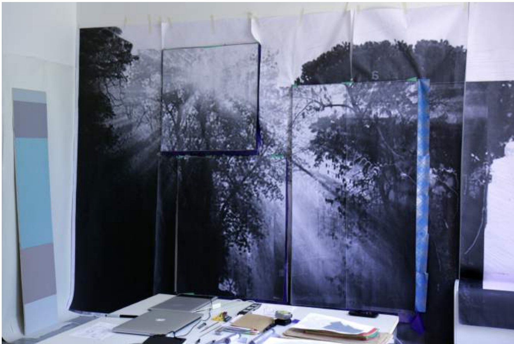
NF/ Residencia en la Real Academia de España en Roma (RAER) 2018 Studio view Real Academia de España, Rome