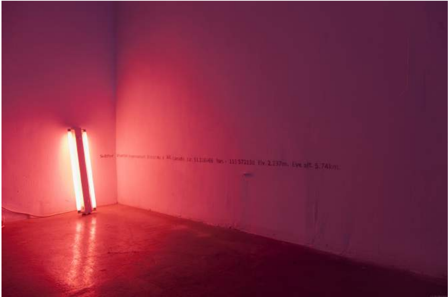
NF / DRAWING MOUNTAINS 2019 Installation view espositivo, Madrid