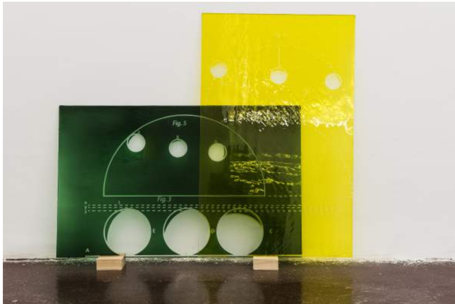
NF/ Laura F. Gibellini Tránsito 2017 Acid engraved mouth-blown glass 50 x 80 cm each [diptych]