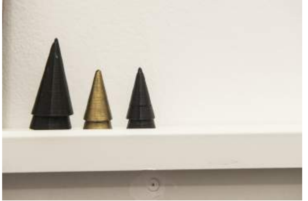
NF / Laura F. Gibellini Key to the Invisible Ice 2017 Extruded polymer Medidas variables