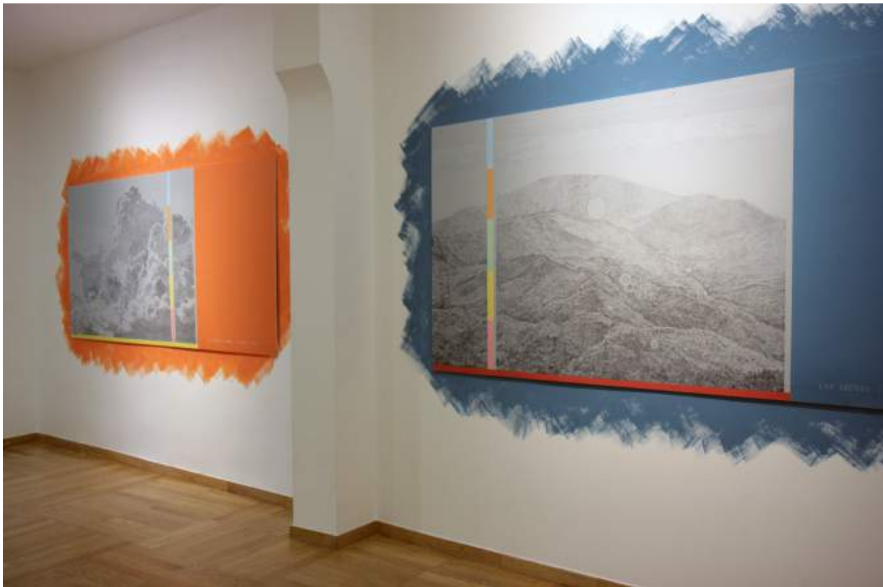
NF / MEDITACIONES ATMOSFÉRICAS. ANTES DEL PRESENTE (603-7465 U) 2017 Installation view Slowtrack, Madrid