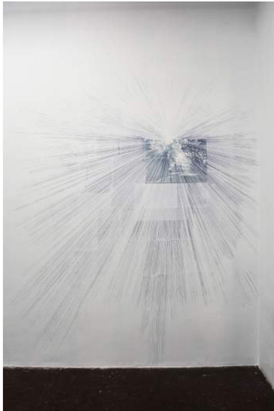
NF/ Laura F. Gibellini Estudio 1 2017 Drawing on paper and wall Variable measures