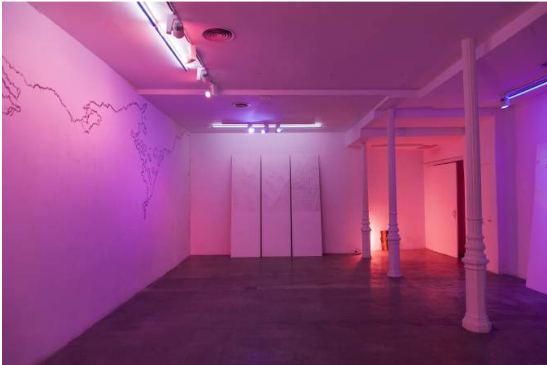
NF/ DRAWING MOUNTAINS 2019 Installation view espositivo, Madrid