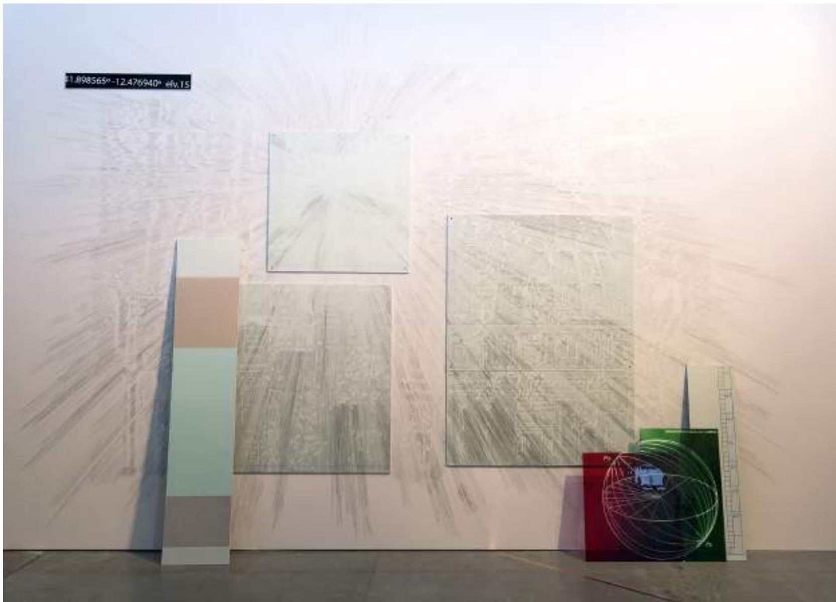
NF / Processi 144_M, entrelazarse con Roma 2018 Installation view Matadero, Madrid