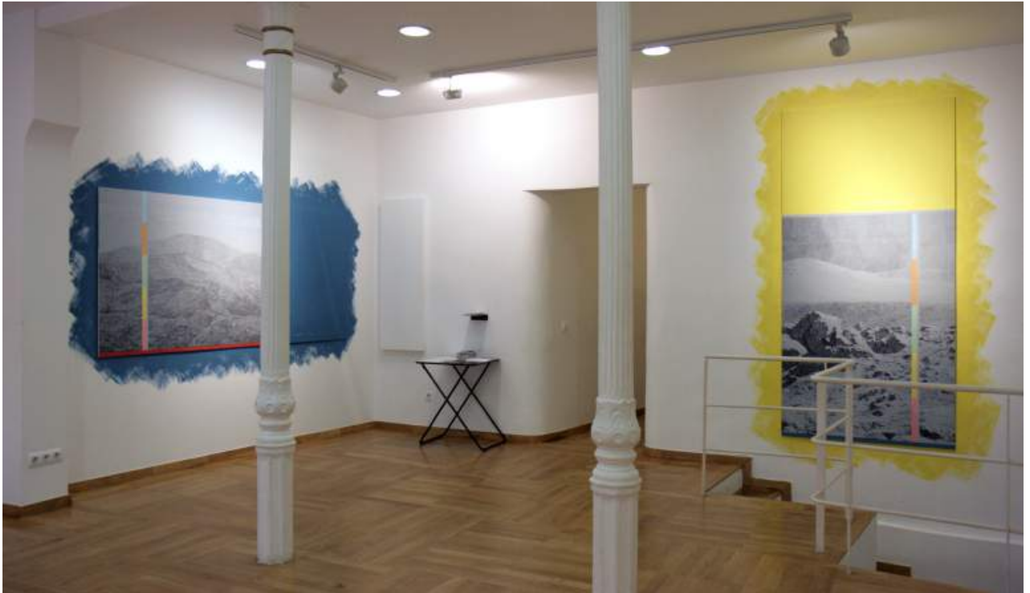
NF / MEDITACIONES ATMOSFÉRICAS. ANTES DEL PRESENTE (603-7465 U) 2017 Installation view Slowtrack, Madrid