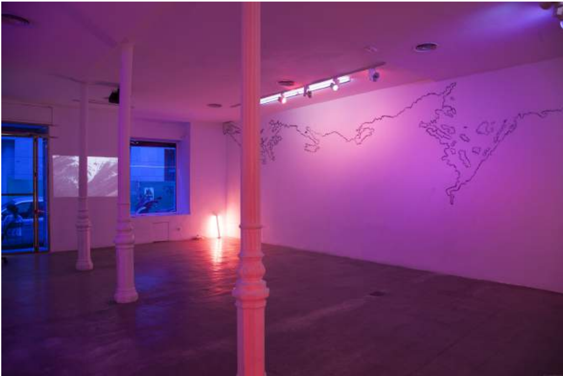
NF / DRAWING MOUNTAINS 2019 Installation view espositivo, Madrid