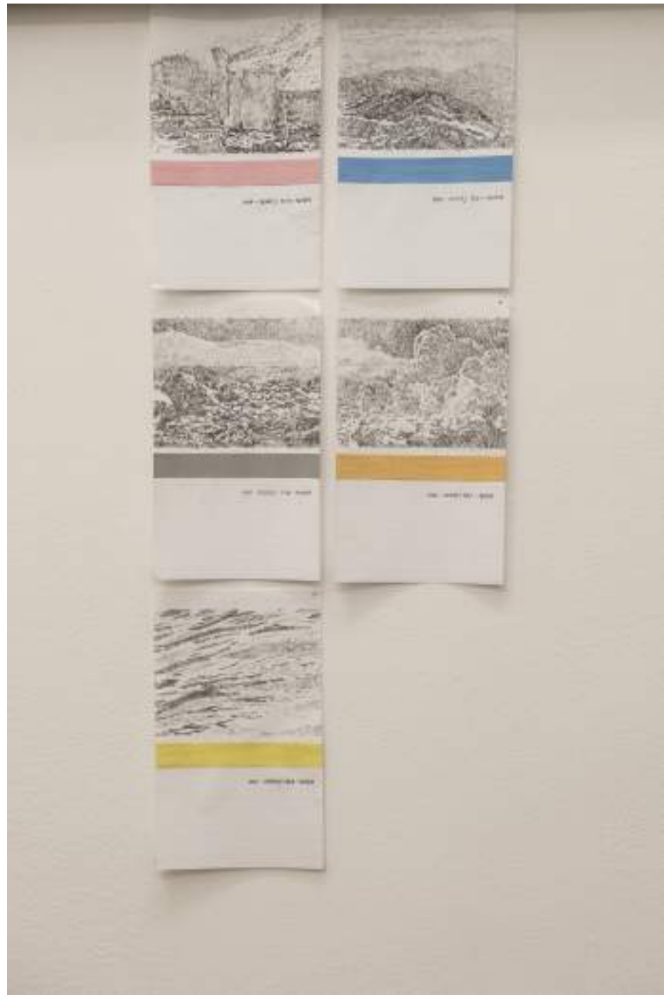
NF/ Laura F. Gibellini Colores del mundo 2016 Graphite and gouache on paper 21 x 13 cm each [series of 6 drawings]